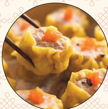
Shu Mai (5pc) $8.99