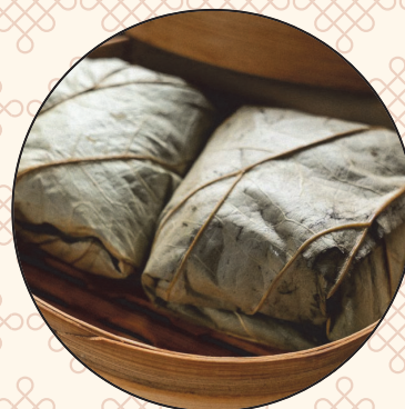
Sweet Rice in Lotus Leaf (2pc) $8.99