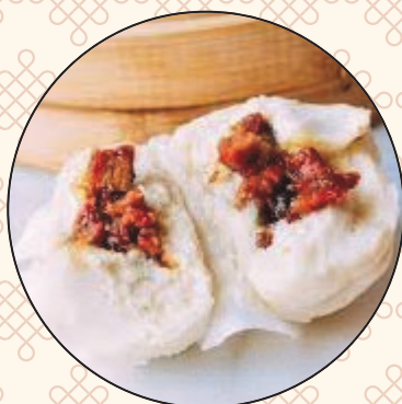
BBQ Pork Bun (3pc) $8.99