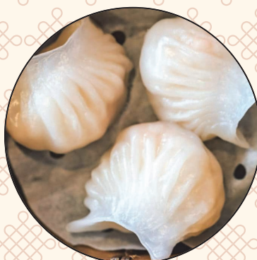
Shrimp Dumpling (6pc) $8.99