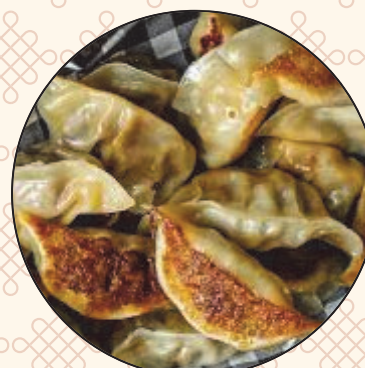
Potsticker (6pc) $8.99