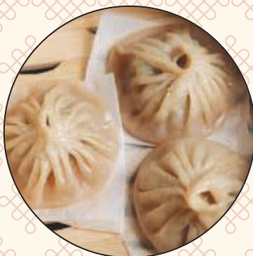
Mini Bun (6pc) $8.99