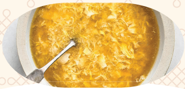
Egg Drop Soup